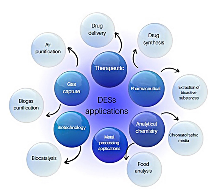
Figure 1. Applications of deep eutectic solvents

The unique properties of DES make them very popular, especially in the context of greening industrial and analytical processes. They are undoubtedly one of the most important discoveries in the field of Green Chemistry. Due to the green nature and the ability to interact with numerous substances, DESs are an interesting novelty, which may turn out to be more cost-effective compared to the sorbents used so far.